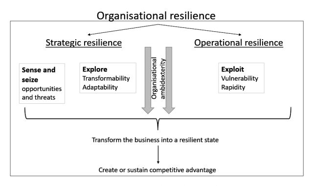
Figure 3. Organisational resilience framework

Strategic resilience can be used in a constant uncertain or turbulent environment without a crisis (Morais-Storz et al., 2018). Excluding the crisis event from Figure 2 shifts the concept closer to organisational ambidexterity. Arguing that strategic and operational resilience are needed, a simultaneous pursuit must be managed in the company. In summary, Figure 3 provide a general framework for organisational resilience.