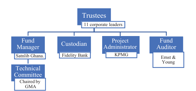
Figure 2. Organizational structure of the Ghana COVID-19 Private Sector Fund