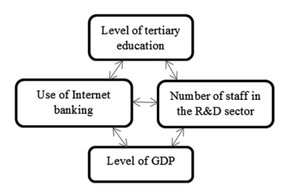
Figure 2. Relationships between the factors influencing the level of digitalization in Latvia (source: authors' construction)

In Figure 2, pictorial representation of the relationships between the factors influencing the level of digitalization in Latvia is provided.