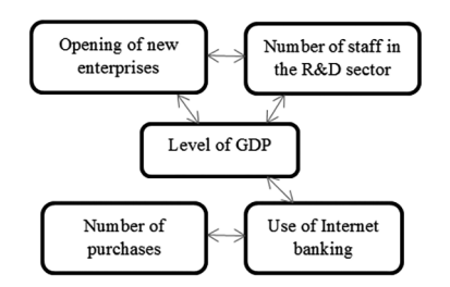
Figure 1. Relationships between the factors influencing the level of digitalization in Estonia

In Figure 1, pictorial representation of the relationships between the factors influencing the level of digitalization in Estonia is provided.